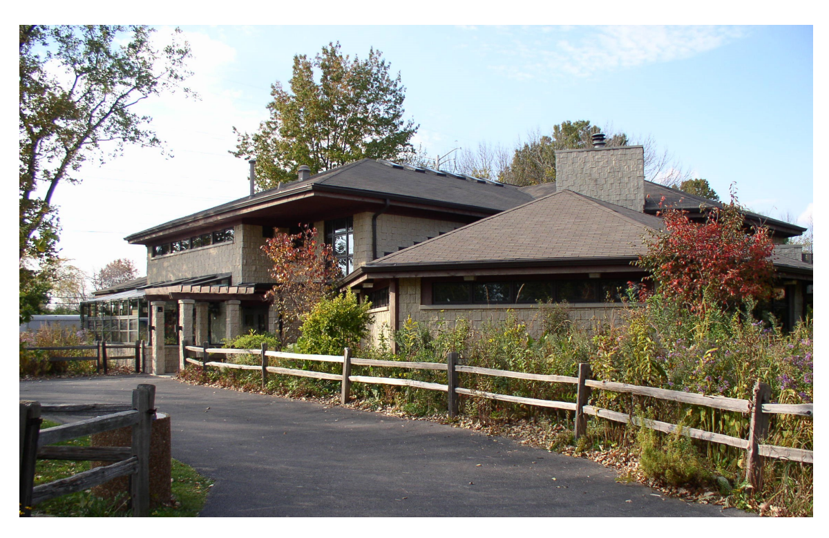
Emily Oaks Nature Center 4650 Brummel Street Skokie, Illinois 60076

Our classroom is located upstairs in the Visitor Facility with a back door that leads outdoors to our trails. Parents will pick-up and drop-off children at the front gate. A staff person will check students in/out and supervise children. Students will wait inside the facility during inclement weather.